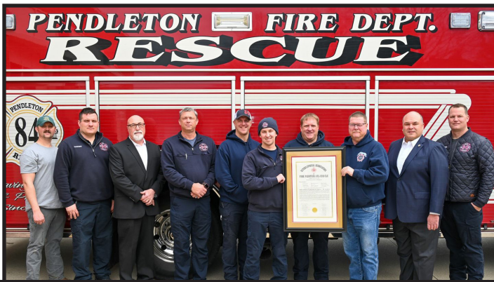
WELCOME SOUTH MADISON IAFF LOCAL 5417