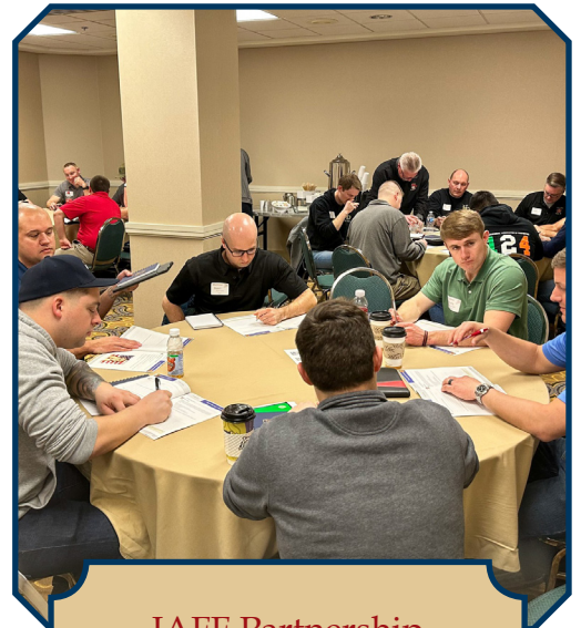
IAFF Partnership Education Program