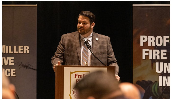
Senator JD Ford