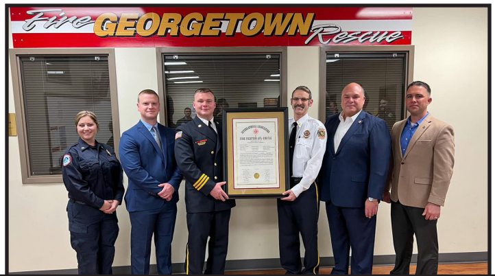
WELCOME GEORGETOWN IAFF LOCAL 5393