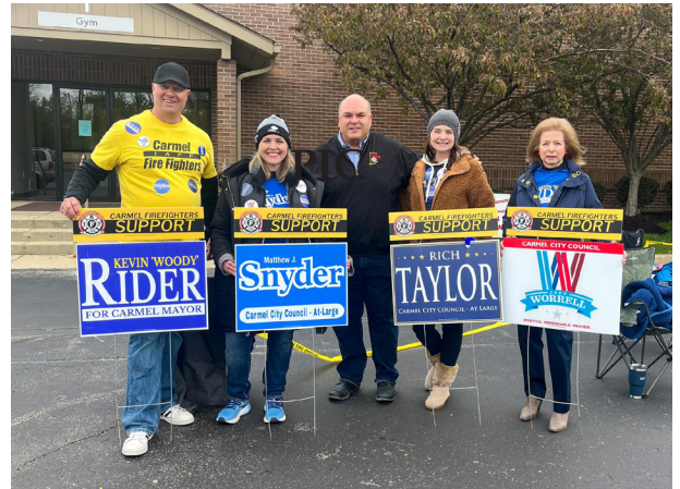
Carmel Local 444