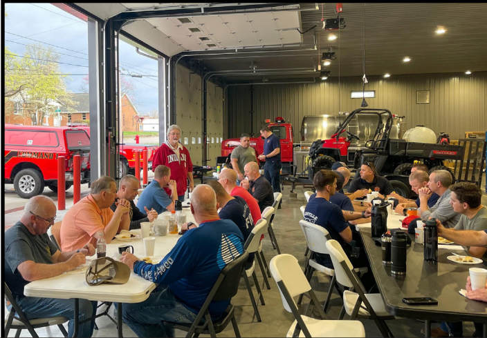
Booneville L4850 Retirees Breakfast

and hope to attend many more at your invitation in the months to come. As always if you need me or a member of our executive board to visit with you or your local, please be sure and reach out and we will be happy to attend. I look forward to seeing many of you in Terre Haute in May for the state convention!