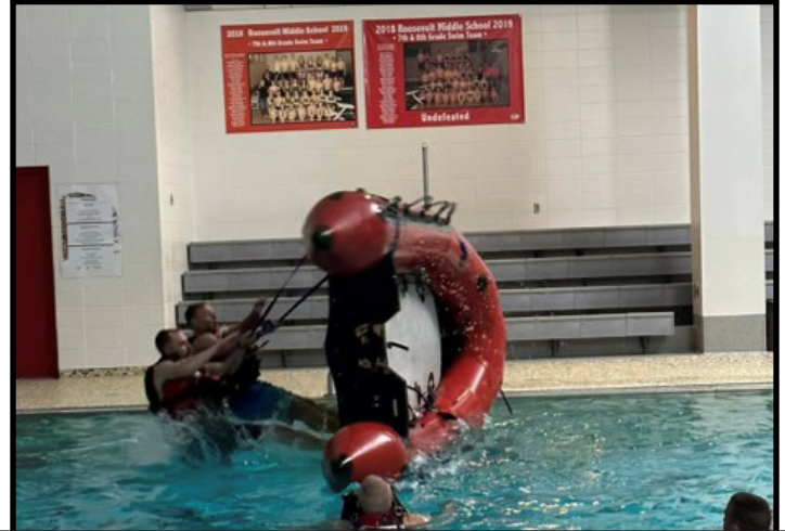
Lafayette & Monticello swift water rescue training