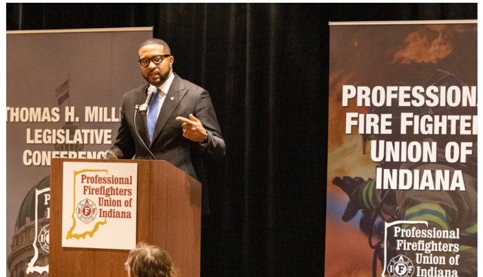
Senator Eddie Melton