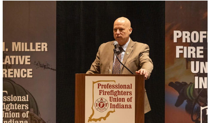
Senator Mike Crider