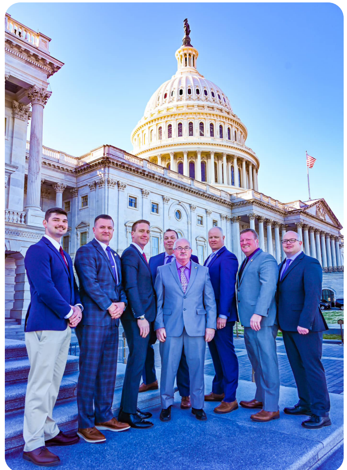
PFFUI Members meeting members of Congress on Capitol Hill at the IAFF Legislative Conference