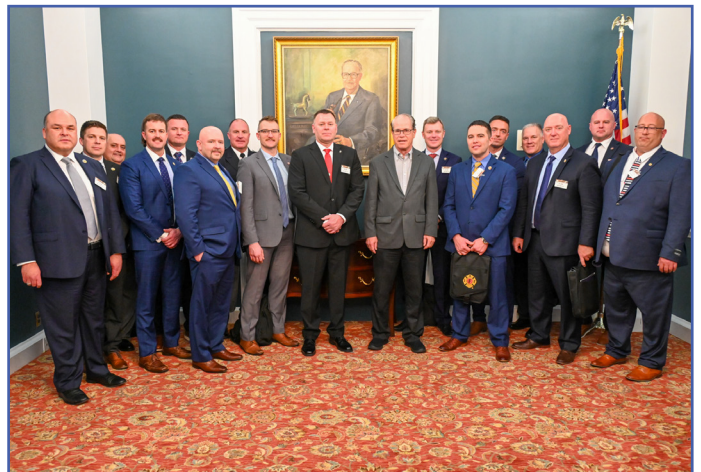
PFFUI members meeting with U.S. Senator Mike Braun on Capitol Hill