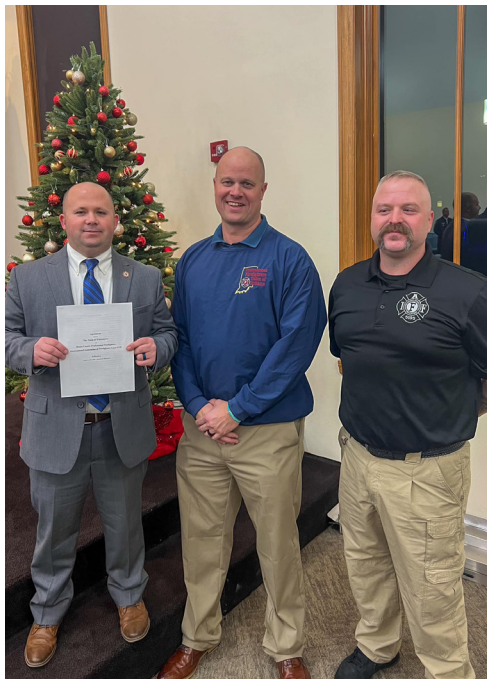
First contract for Whitestown Fire Fighters Boone County Local 5195