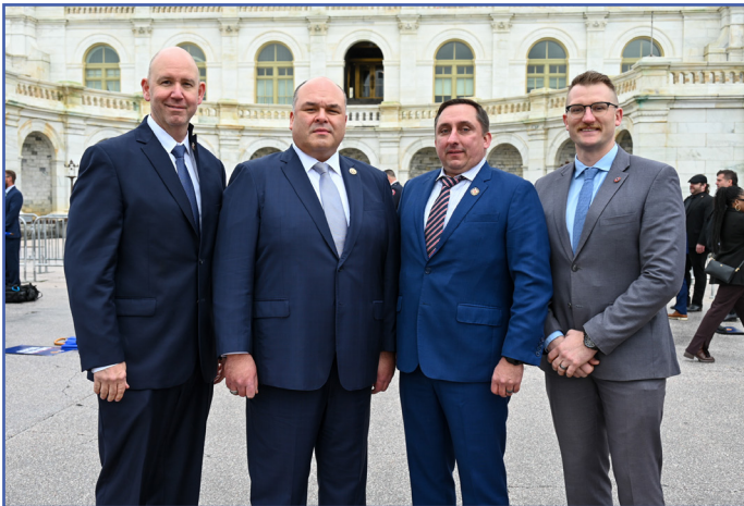
PFFUI members on Capitol Hill at the IAFF Legislative Conference in Washington, D.C.