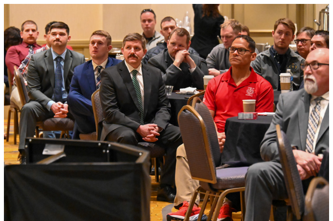
IAFF Partnership Education Program