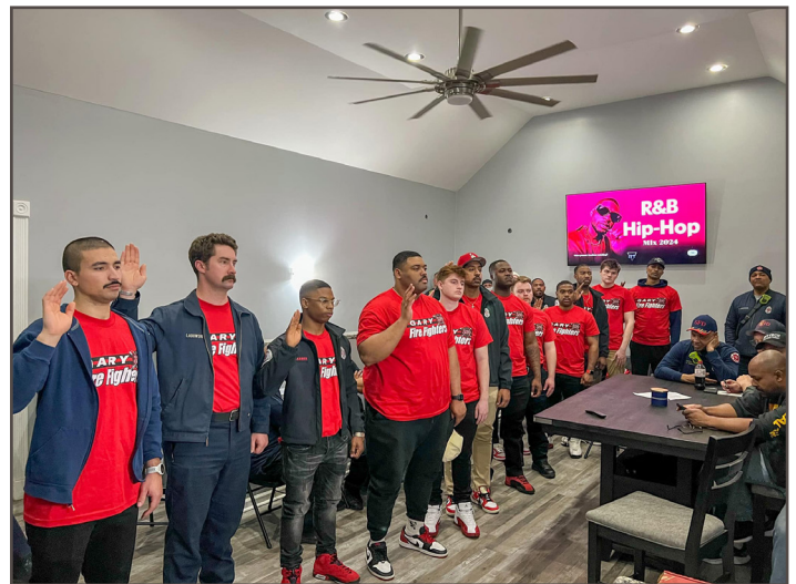
Newly sworn-in Gary Local 359 members