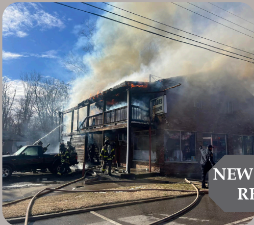
NEW ALBANY RESCUE