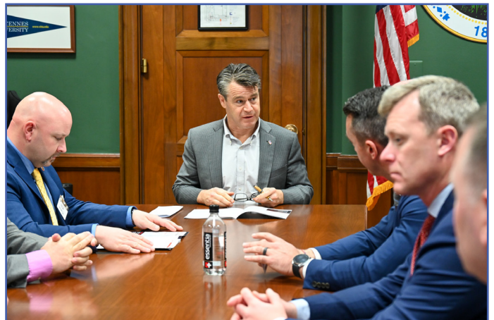
U.S. Senator Todd Young meeting with PFFUI members in Washington, D.C., during the IAFF Legislative Conference.