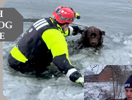
SOUTH BEND DOG RESCUE