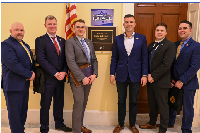
Members meeting with IN-2 Congressman Yakym on Capitol Hill