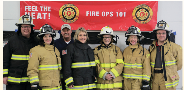
Members of IN General Assembly