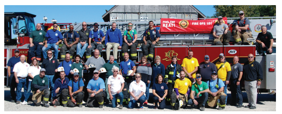
Hamilton County Local 4416 and Carmel Local 4444 hosted Fire Ops 101

I hope everyone and your families have a great and safe Holiday season. Reach out anytime you need anything and or make it to the southern part of this great state.