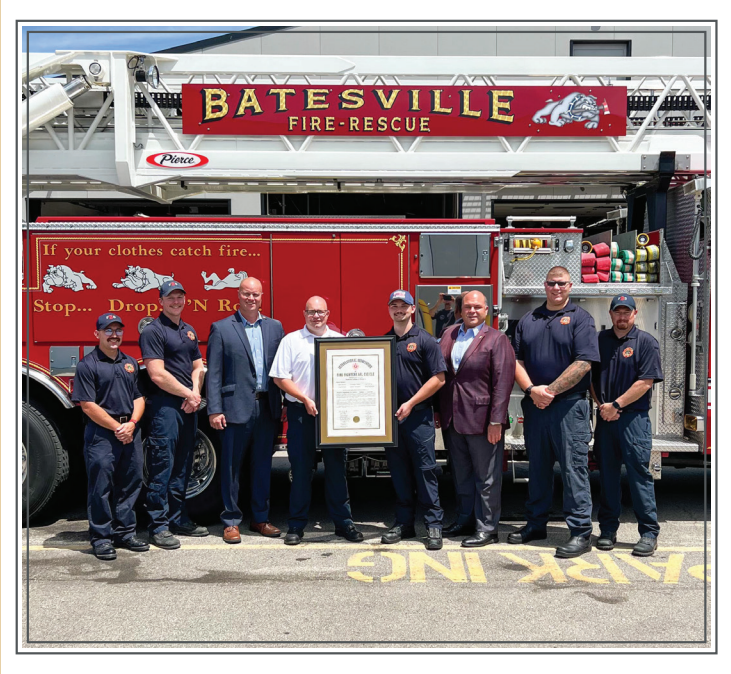
Charter presentation for Batesville Local 5380